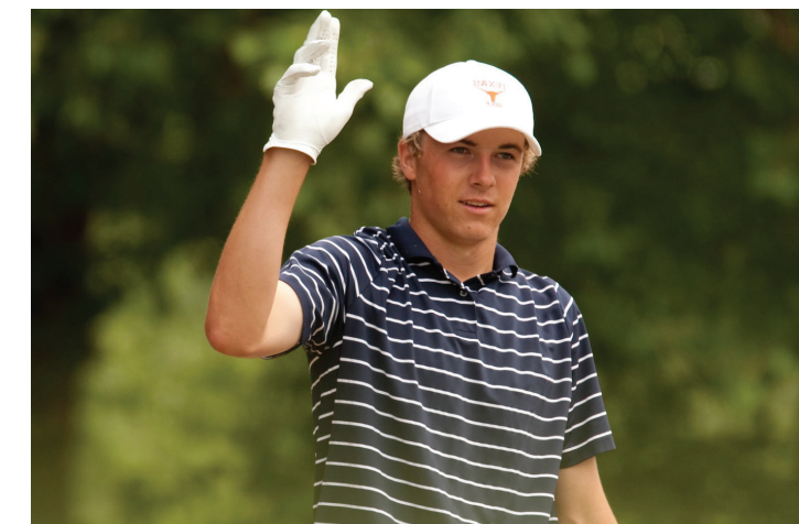
In 2010, Jordan Spieth received his first exemption at age 16. He went on to receive another exemption in 2011 and then turned pro in 2012.